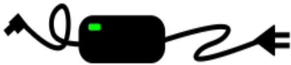
Switching power X 1